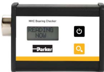
*MHC - Machinery Health Check